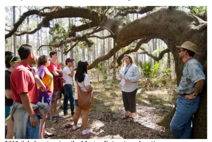
2011 Scholars touring the Marine Extension education programs on Skidaway Island.